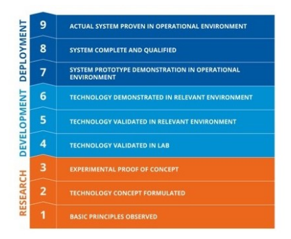
Figur 3: Technological readiness

The diagnostic modules for anxiety and sleep disorders have symptomand characteristic overlap with depression and are thus likely to fit the existing solution well. These two disorders are also prerequisites for future research on the validity of the tool. Development of a